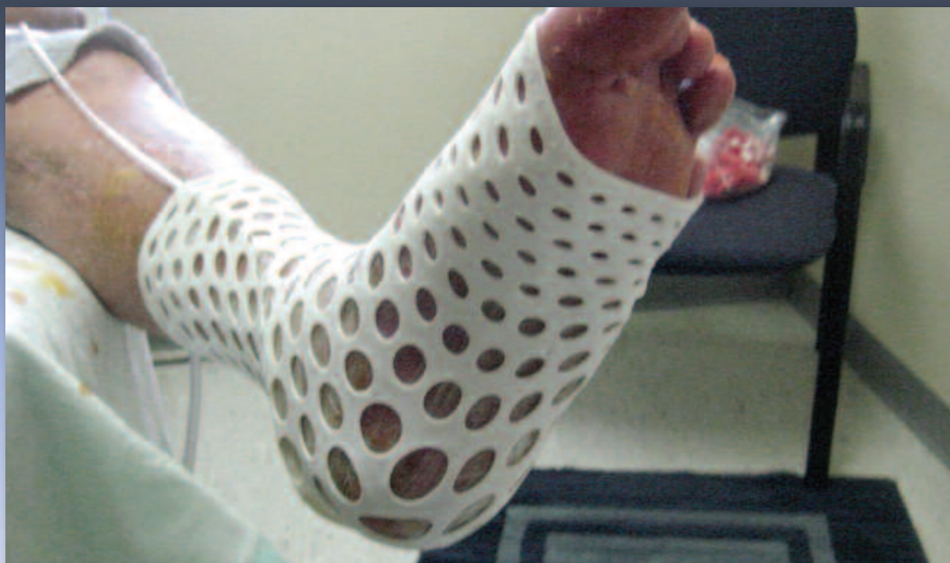
Patient utilizing Action Bandage for retention over Negative Pressure Wound Therapy system.

Addressing the need for retention in patients with fragile skin or with wounds located in difficult areas is a challenge for clinicians.